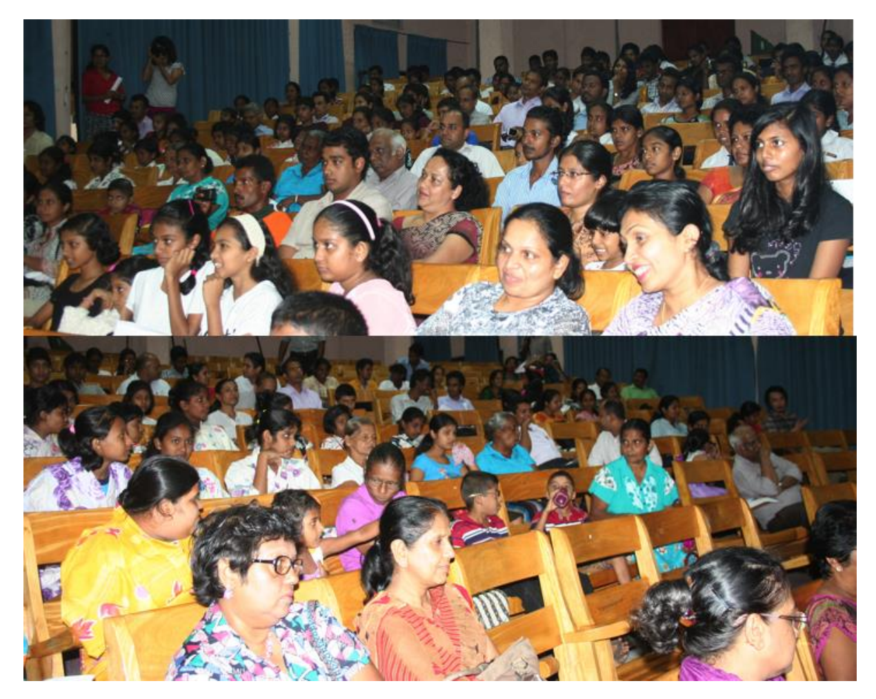
Part of the Invitees and Audience