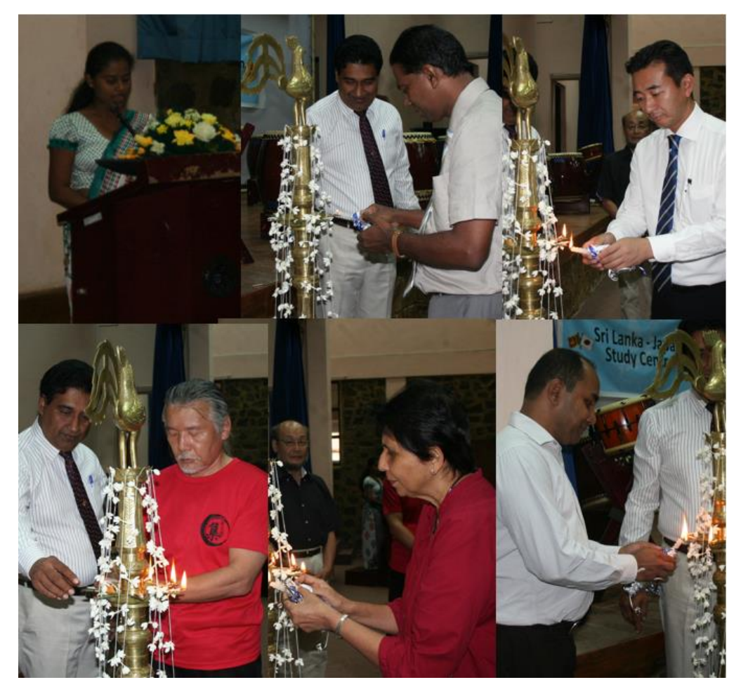
Traditional lighting of the oil lamp