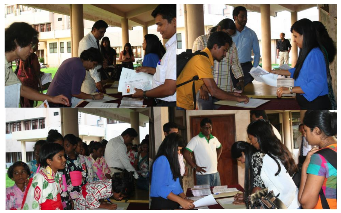
Registration of the participants