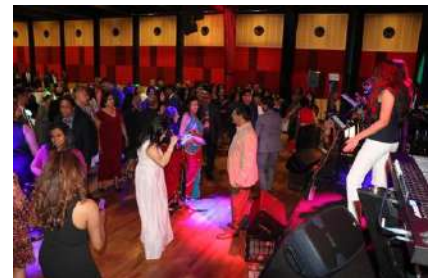
Hantana Night 2024

A PUAAN team joined over twelve thousand walkers at the 7 Bridges Walk in Sydney on Sunday, 20th October 2024, to raise funds for the Cancer Council.