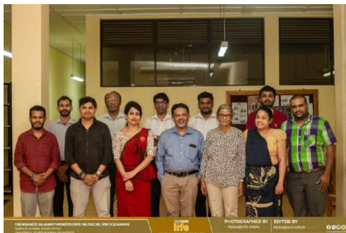
UPSAA committee with the organizing committee