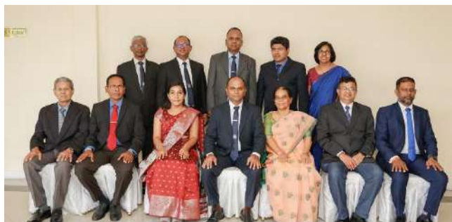
5 th Executive committee of VAAP

In 2024, VAAP strengthened its commitment to veterinary education, student welfare, and faculty development through impactful initiatives. By fostering alumni engagement, it has significantly contributed to the advancement of the Faculty of Veterinary Medicine and Animal Science at the University of Peradeniya.