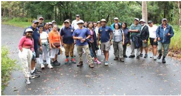
Summer walk at Bobbin Head

Next up, PUAAN participated in the Clean Up Australia Day, a community event on Sunday, 3rd March 2024 at the Bungarribee Park, Arndell Park. The autumn Hunter Valley weekend outing was held from Friday, April 19 to Sunday 21, 2024.