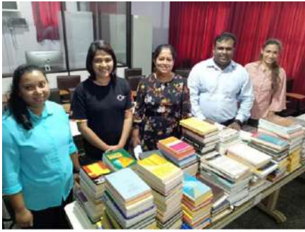
Books received at the Department of Mathematics