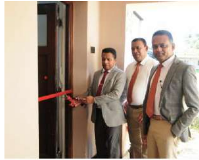
Ceremonial opening of the Center for Psychological Assessment and Wellbeing

The Association supported the refurbishment of the Center for Psychological Assessment and Wellbeing at the Department of Psychology, Faculty of Arts; the fifth such faculty-based project in the campus. The center was opened on 4th March 2025.