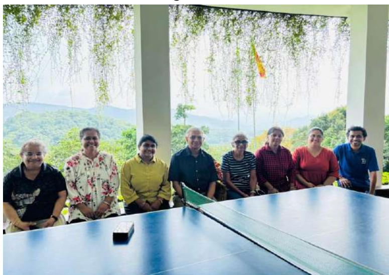
The annual trip to Arangala forest lodge, organized by UPSAA