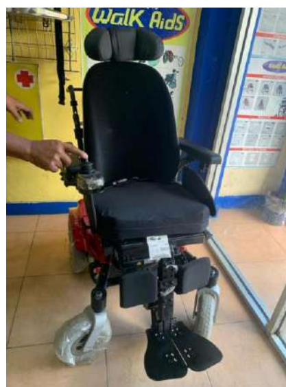
Donation of walking aid