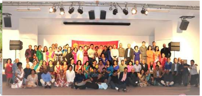
Saturday at the Hunter Valley outing

The Sri Lankan Inter-University Six-a-Side Cricket Carnival was held on May 19, 2024, with teams from Peradeniya, Colombo, Jayewardenepura, Kelaniya, Moratuwa, Ruhuna, and Sabaragamuwa universities. PUAAN men's team emerged as champions.