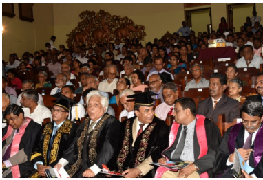
Dignitaries seated in the front row