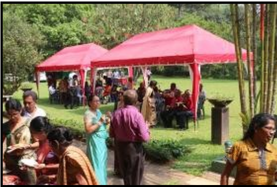
Guests at lunch –Marquees in the garden of the Lodge