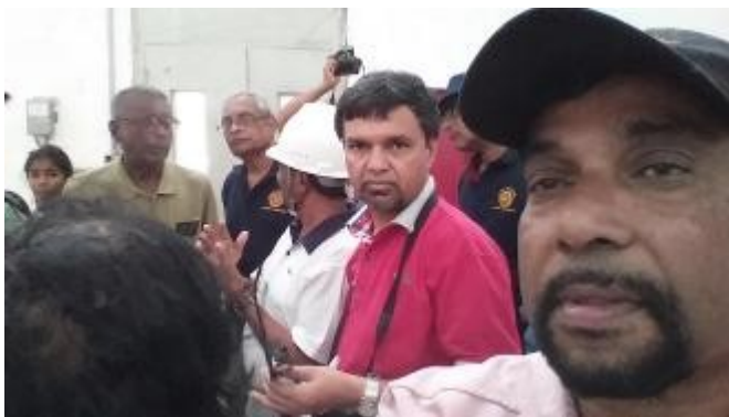
Project Director surrounded by the participants