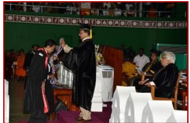
Vice-Chancellor conferring the Degree on a graduand