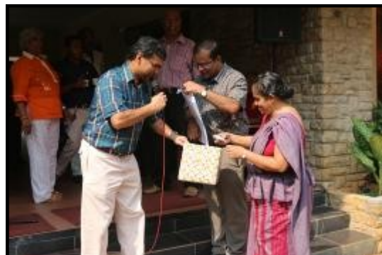
The Vice-Chancellor's wife drawing the lucky raffle ticket