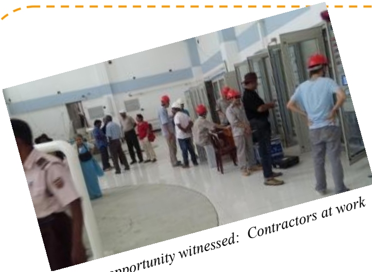
A rare opportunity witnessed: Contractors at work