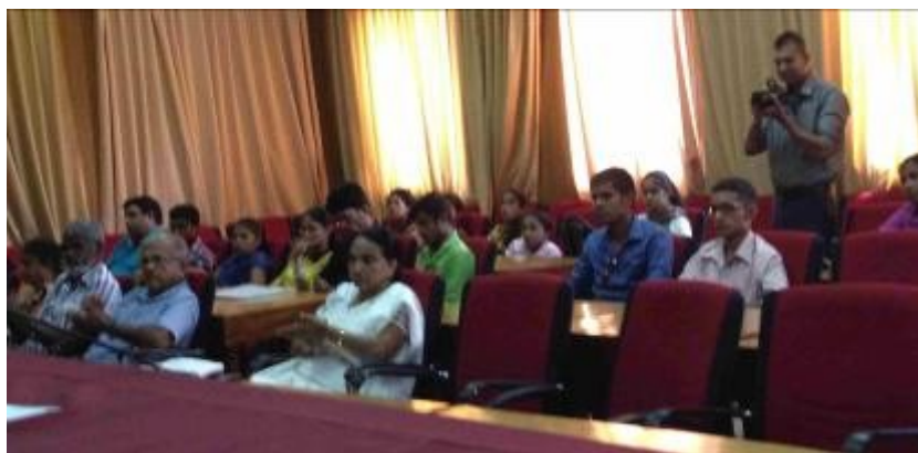
Section of the audience at the ceremony

Left: X donating the equipment . Y receiving the equipment on behalf of the university The academic member in charge of the program for the special needs students receiving the donation on behalf of the University