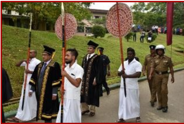
Convocation procession led by the Vice-chancellor & the Deputy Vice-chancellor, making its way to the Gymnasium.