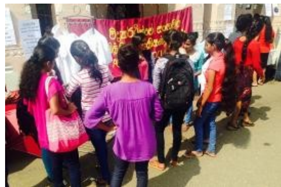
The AAUP make shift stall organized on the day of the Convocation. T-shirts, Mugs & Car stickers with the University logo were put on display for sale. Souvenir items including fifty T-shirts to the value of Rs. 63,900/- were sold at the stall.