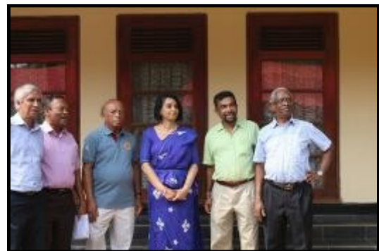
Senior & not so senior alumni with the outgoing President