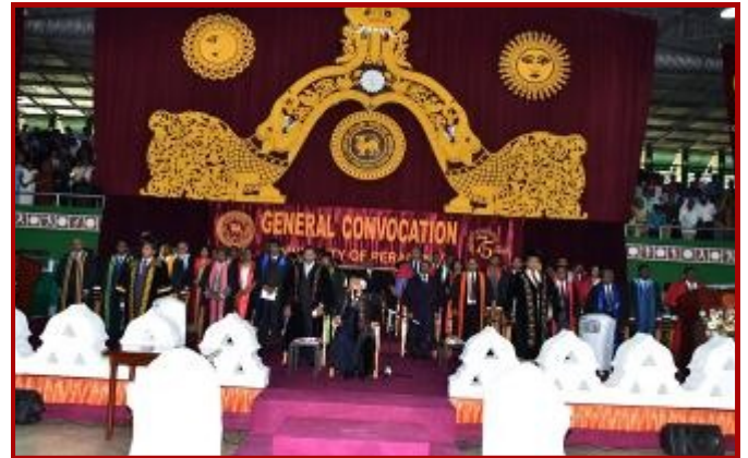
Ceremonial opening of the of the General Convocation 2016 with the singing of Jayamanagala Gatha