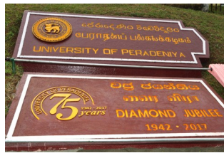
Commemorative Plaque placed at Galaha Junction