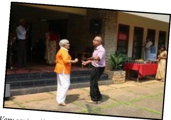
Very senior Alumni enjoying the rhythm of music