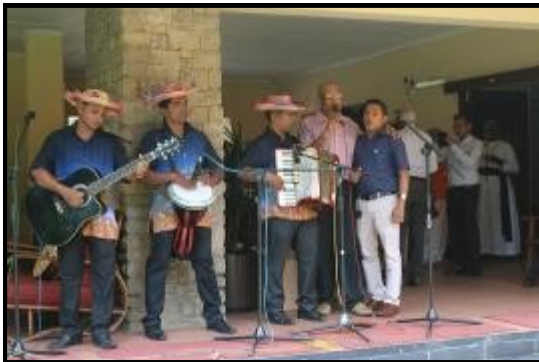
Alumni singing to the tune of the band