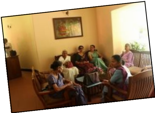
Ladies in conversation