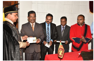
Release of the Commemorative Stamp & First-day cover

The AAUP held a stall at the IT foyer, where specially T-Shirt with the Diamond Jubilee logo was on sale.