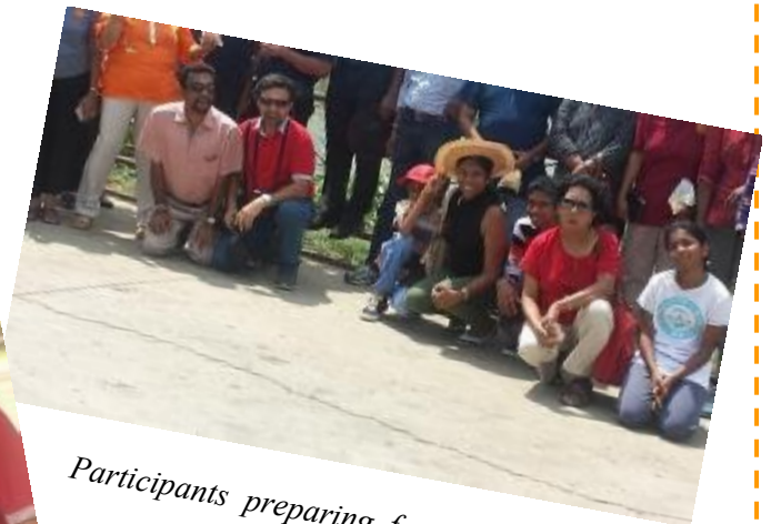
Participants preparing for the group photo