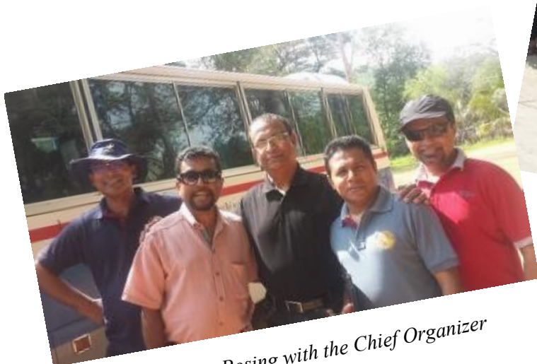
Happy faces: Posing with the Chief Organizer