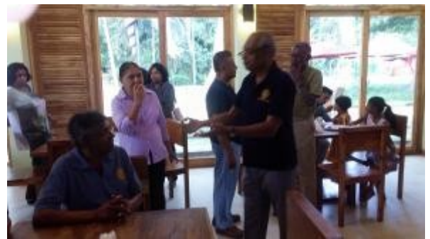
Break for breakfast