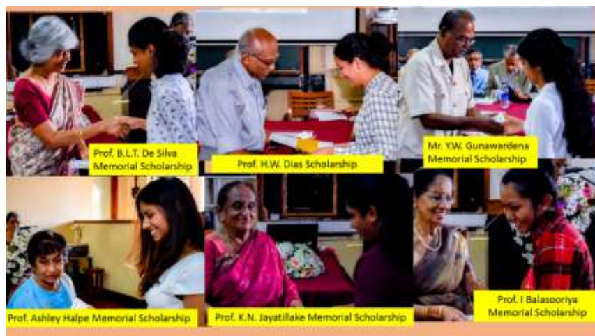
Scholarships being awarded to respective recipients