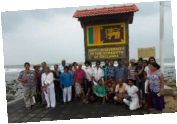
Participants on arrival in Jaffna