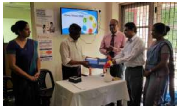
At the Health Center - (L) President AAUP addressing the staff (R) Items being handed over