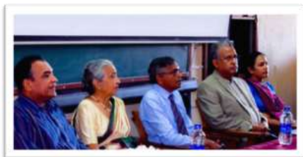
Dignitaries at the Head Table