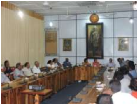
AAUP Jaffna Chapter in the Making – At the University of Jaffna