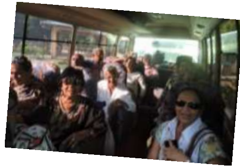
Enjoying the long journey on the Jaffna Express train (Kurunegala to Jaffna) & shorter bus rides (to and from railway stations)