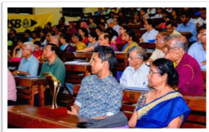
Section of the Audience at the 29 th AGM