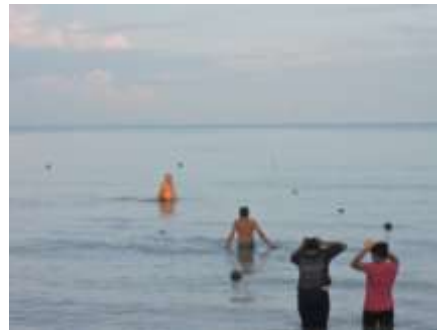
A cool dip in the Indian Ocean