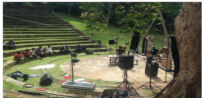
An anxious moment - awaiting the arrival of the audience.