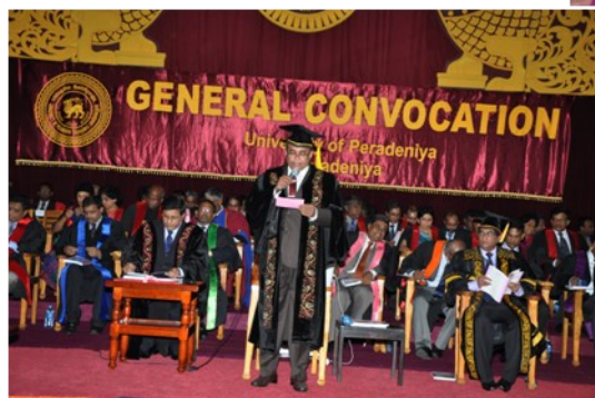
The Vice-Chancellor Declaring the convocation open.