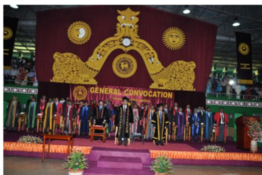
The inauguration of the General Convocation 2015 with the singing of the National anthem.