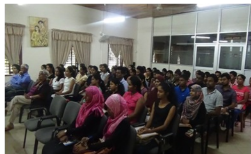
The participants of the workshop.