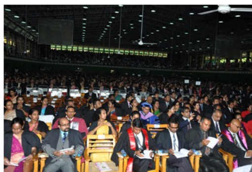
A section of the audience-degree recipients, academic staff & guests.