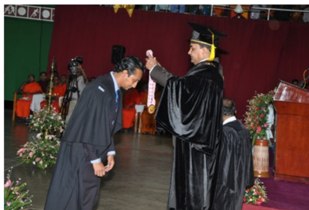
The Vice-Chancellor garlands a graduand