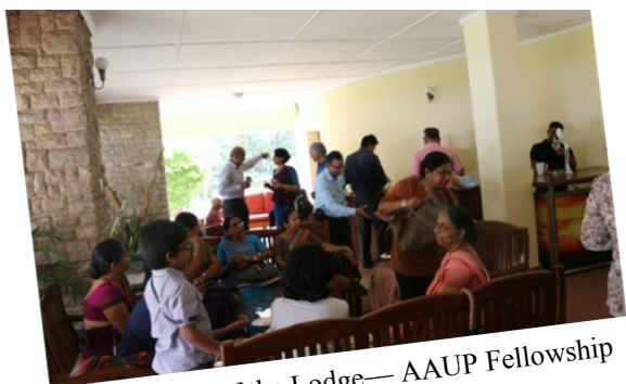
In the lobby of the Lodge—AAUP Fellowship