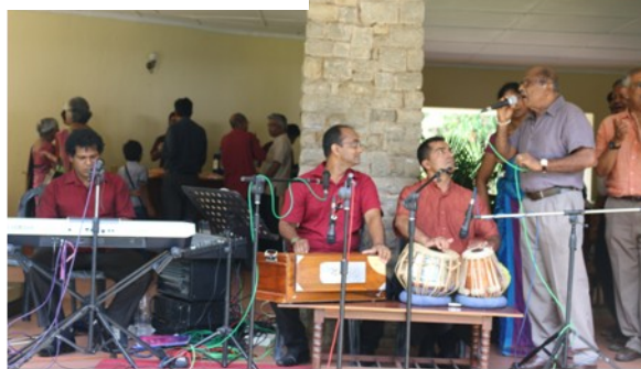
An Alumnus sings with Oriental musicians