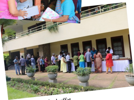
Alumni at the buffet