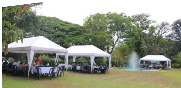
Guests at lunch—Marquees in the back garden of the Lodge