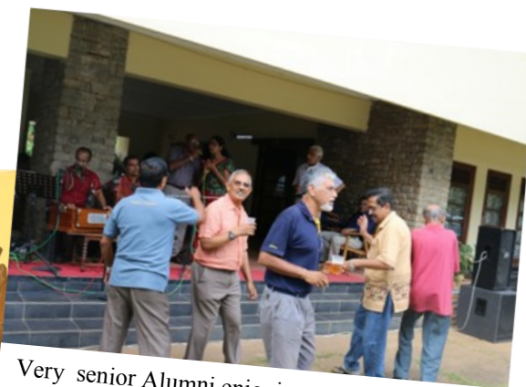
Very senior Alumni enjoying the rhythm of music