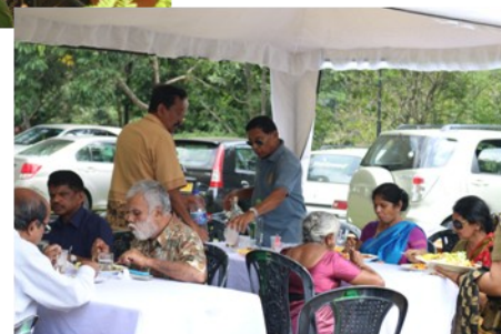
Alumni enjoying lunch