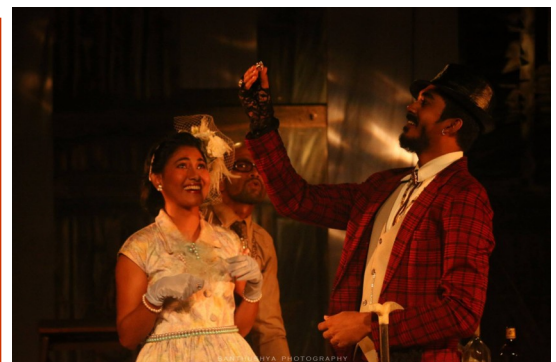
A scene from the play 'Dutu Thena Allanu'.