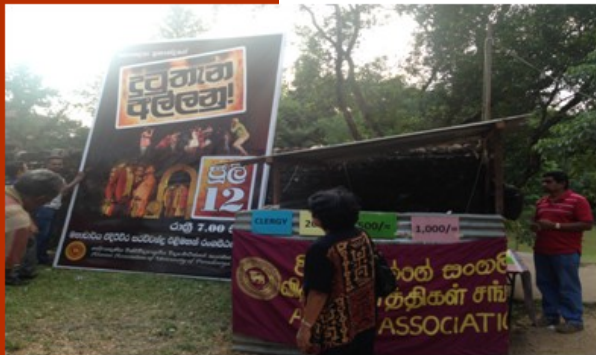
The life sized poster at the entrance to the Wala.