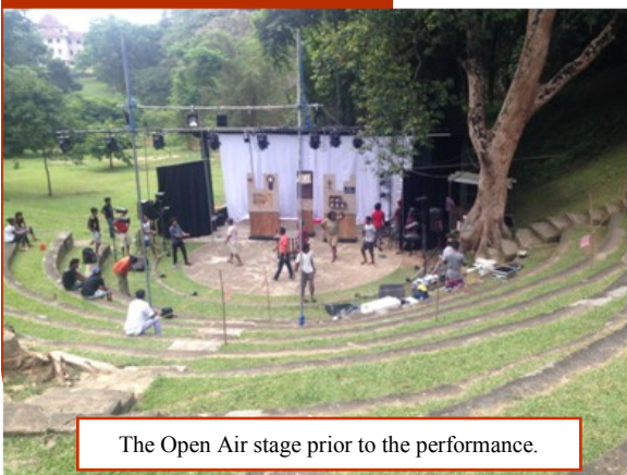
The Open Air stage prior to the performance.