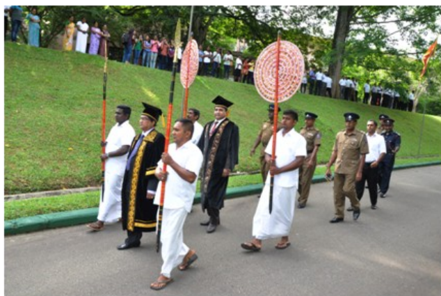
The Convocation procession led by the Vice-chancellor & the Deputy Vice-chancellor, making its way to the convocation hall.